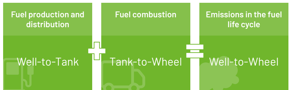
The fuel life cycle

Many clients demand comprehensive reporting on CO 2 emissions from their transportation service providers. Creating such reports often requires a great amount of manual effort, which costs a lot of time.